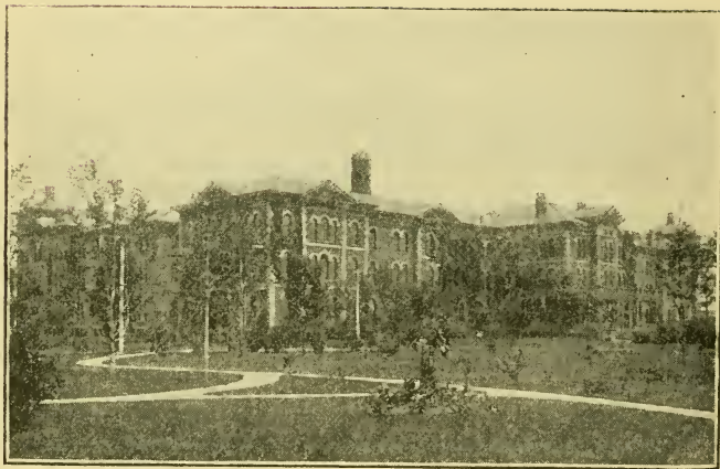
PENNSYLVANIA SOLDIERS AND SAILORS HOME.